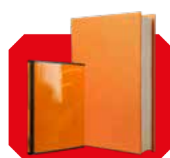
Books, Music & Media