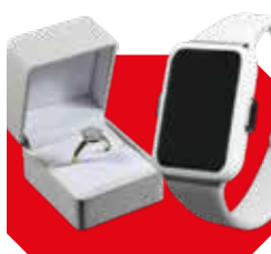
Jewels & Watches