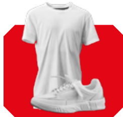
Clothing & Footwear