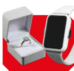
Jewels & Watches