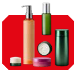
Beauty & Personal Care