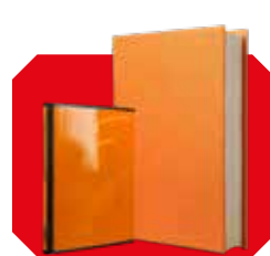
Books, Music & Media