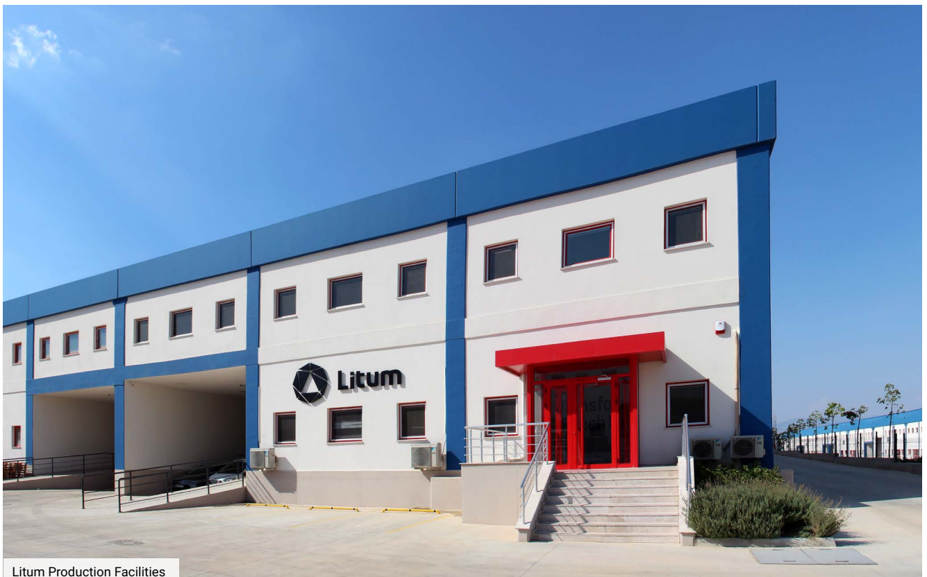
Litum Production Facilities