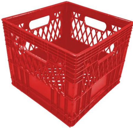
16-QT. MILK CRATE