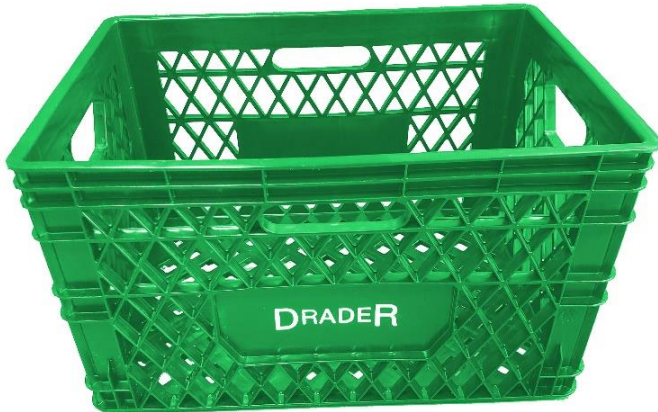
24-QT. MILK CRATE