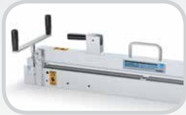
Clipper® 845LD Belt Cutter

The Flexco Laser Belt Square can be used in conjunction with these Flexco products to keep parcel belts up and running at peak performance.