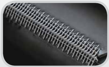
Clipper® Wire Hook Fastening System