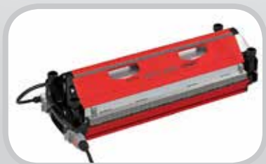
Novitool® Aero® Splice Press