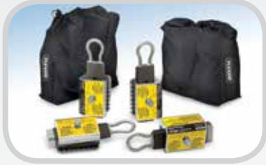
Smart Clamp™ Belt Clamps

Use the 845LD Belt Cutter in conjunction with these Flexco products to keep parcel belts up and running at peak performance.