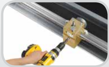
Clipper® Wire Hook Fastening Systems