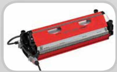
Novitool® Belt Fabrication Tools