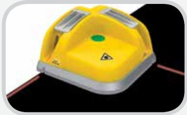
Laser Belt Square