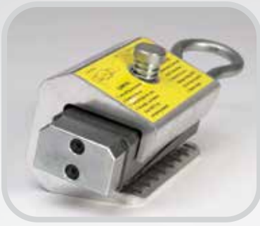
Large impact plate provides easy striking surface.