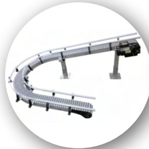
Helical Plain Bend