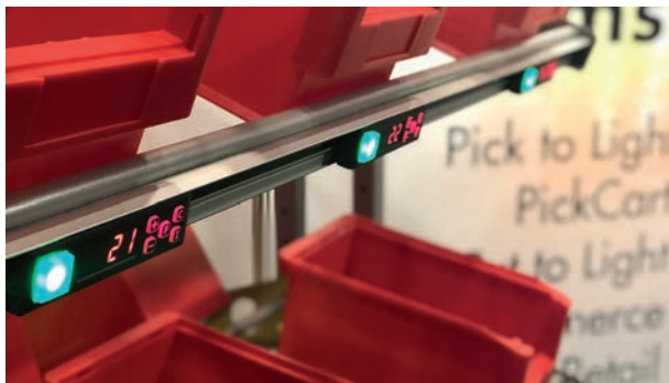
Pick to light installed at one of our customers

Pick by Light solutions generate higher productivity rates and fewer mistakes resulting in significant lower cost. As the system is easy to operate, employees do not require extensive training and are therefore up and running in no time. New hires can be part of your productive workforce rapidly.