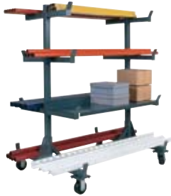
Mobile Pipe Carts

Visit spgusa.com to download our complete material handling catalog.