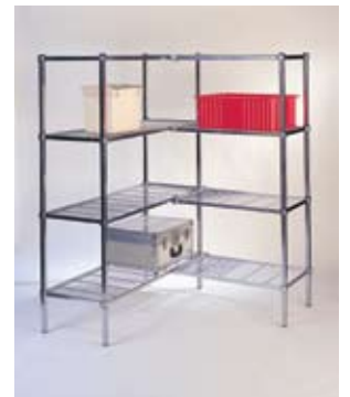
Standard Duty Wire Shelving