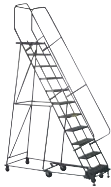
The Patented Gillis "6-Wheeler"™