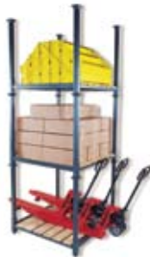
Airector® Stacking Racks