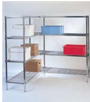
Heavy Duty Wire Shelving

SPG offers the industry's widest array of materials, components and accessories. That means we can provide a custom shelving solution for virtually any application — in any space — that's strong, versatile and easy to assemble.