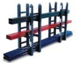
Mini-Module® Patented Stacking Racks