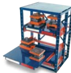
EZ-Glide™ Roll-Out Shelving