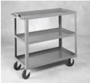
Rolling Service Stock Carts

Our wide selection of carts incorporates unique design features, quality construction, proven durability — and everything you need to push your business forward.