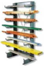
Minitree™ Light Duty Cantilever Racks

Below are a few examples of the wide array of styles, configurations and load capacities that Jarke offers for virtually any application. Each is designed and built to provide easy access to materials and maximum storage from every square inch in your facility.