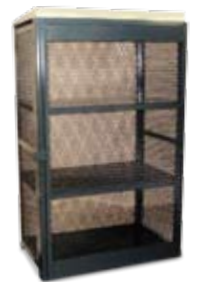
Cylinder Storage Cabinets