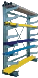
Quiktree® Light-Medium Duty Cantilever Racks