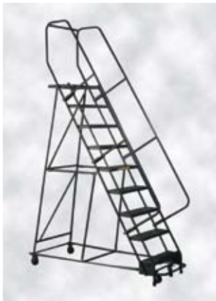
60° Standard Angle Ladders

With innovative features, proven durability and heavy duty construction, no one else offers you such a wide selection of rolling steel and fixed ladders. Or more ways to elevate the performance of your operation.