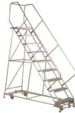
The New "Multi-Directional"™ Ladder