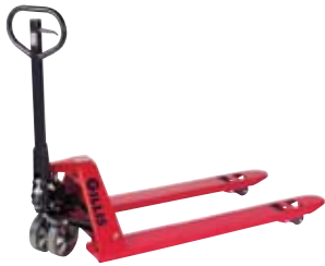
Hand Pallet Trucks