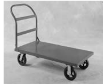
Heavy Duty All-Welded Platform Trucks