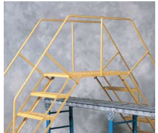
50° Crossover Ladders