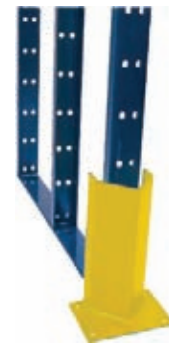
Post Protectors Perfect for Pallet Racking