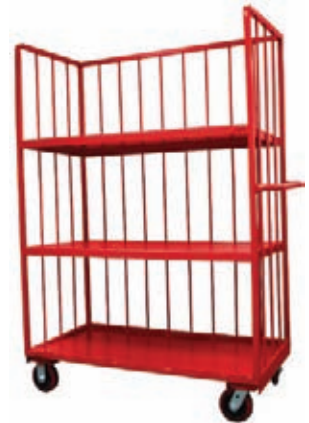
Open Portable Shelf Carts with All-Welded Construction