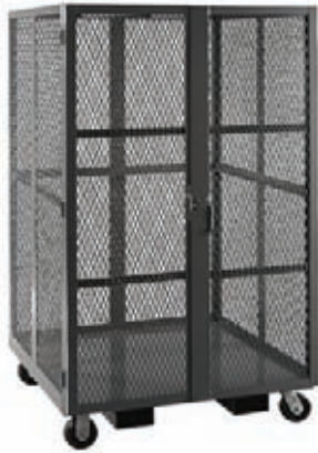
All-Welded Heavy Gauge Steel Security Carts