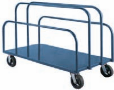
Durable Panel Carts