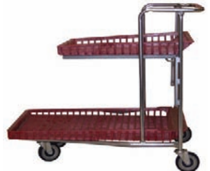
High Performance Flip-Top Garden Carts