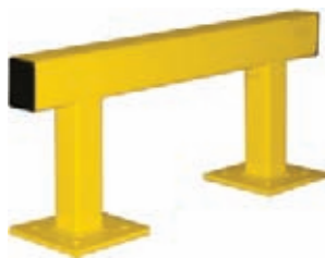
All-Welded Single Rail