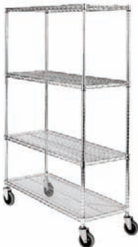
Wire Carts with Round or Square Posts