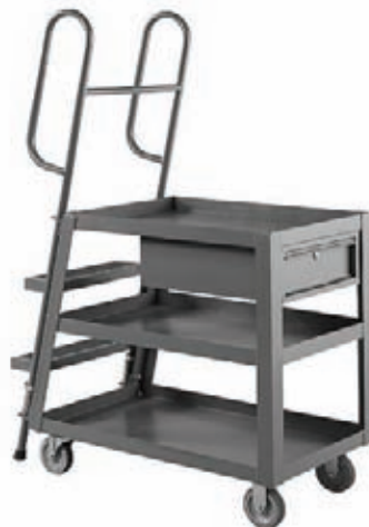
Heavy Gauge Steel Ladder Carts