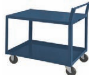
Highly Maneuverable 2-Shelf Shop Trucks