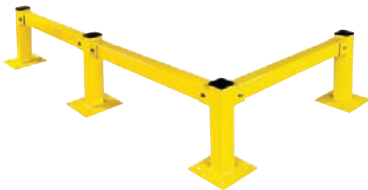
Bolted Guardrail System