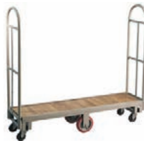
Corrosion-Resistant Wood Deck U-Boat