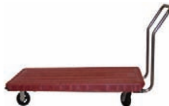
Multi-Purpose Plastic Deck Platform Truck