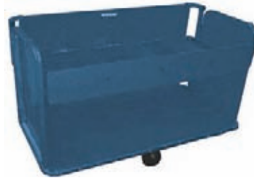
Versatile 3-Side Tub Cart with Shelf