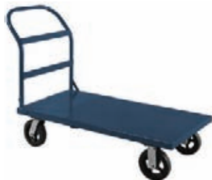
Heavy-Duty All-Welded Platform Truck