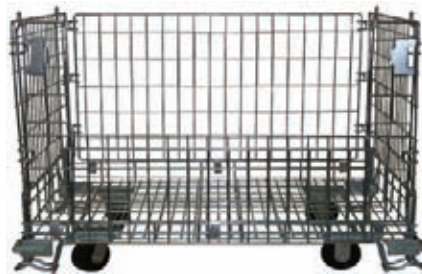
Big Capacity Wire Cardboard Carts