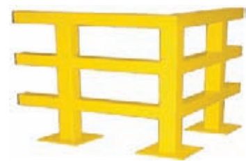
All-Welded Corner Guardrail