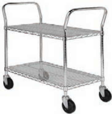
2-Shelf and 3-Shelf Utility Carts

SPG offers you the broadest range of carts available. Beyond mere selection, SPG carts offer you rugged construction, quality that endures, and economy that can have a big impact on your bottom line. In fact, SPG carts are resistance welded for greater strength and offer significant performance advantages like our quick-release caster bracket. Our lineup includes: