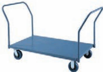
Versatile Dual Handle Platform Truck