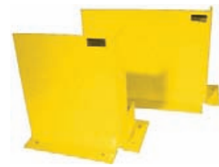
End of Aisle Protection