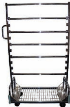
Sturdy Intimate Racks