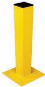
Bollards Ideal for Dock Areas