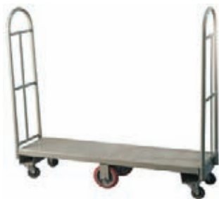
Heavy-Duty Steel Deck U-Boat