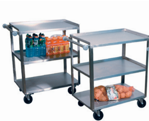
Non-Corrosive, Big Capacity Stainless Steel Carts