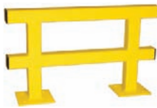
All-Welded Double Rail