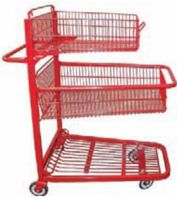
Multi-Purpose 3-Tier Carts