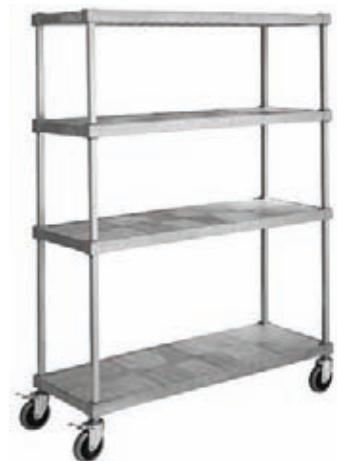
Plasteel® Non-Corrosive Carts