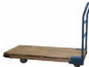
Big Capacity Wood Deck Platform Truck