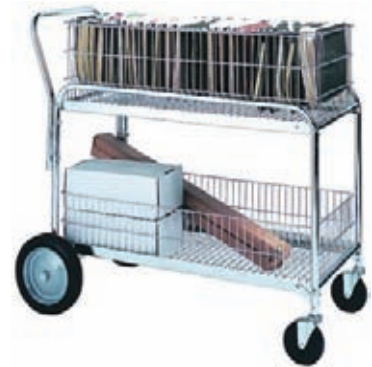
Chrome Plated Mail Carts