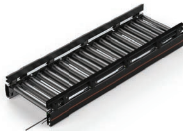
CT01 Roller Conveyor Straight Accumulating 24V