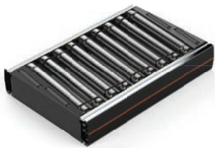
CT01 Roller Conveyor Alignment 24V