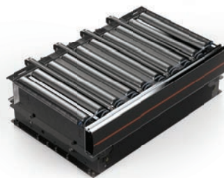
KP02 Transfer Module 24V