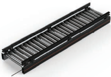
CT01 Roller Conveyor Straight 24V