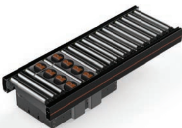
KP01 Pop-up Module 24V