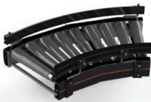
CT01 Roller Conveyor Curve 24V