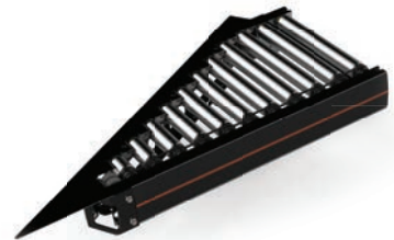
CT01 Roller Conveyor Merge 24V