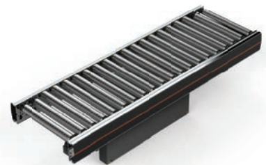
CT01 Roller Conveyor Straight General 400V