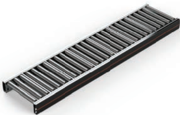
CT01 Roller Conveyor Straight Non Driven