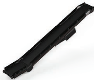
CT02 Belt Conveyor Decline 400V