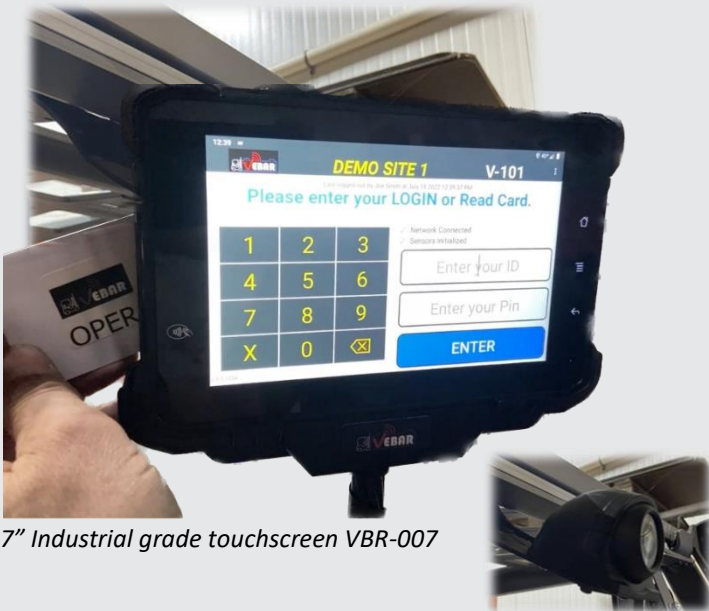
7" Industrial grade touchscreen VBR-007

Vebar provides the industrial grade & rugged vehicle touch terminals that work out of the box to provide These come with on-board sensors, cellular and other options to adapt to your monitoring and management needs. Or use your forklift computers or user's phones & tablets to access Vebar applications to perform pre-shift inspections, monitoring and to have access to real-time fleet data.