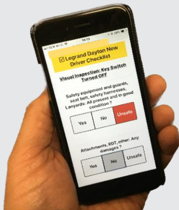
Bring your own device and use Vebar native- or web-app