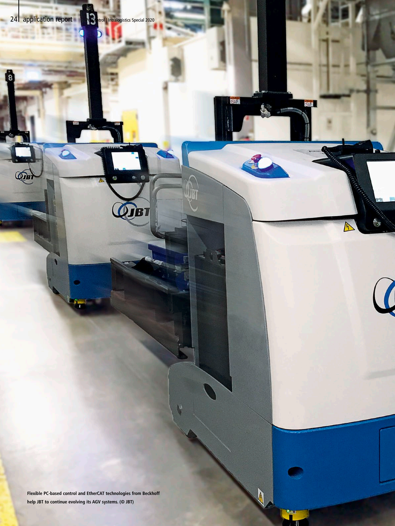
Flexible PC-based control and EtherCAT technologies from Beckhoff help JBT to continue evolving its AGV systems.