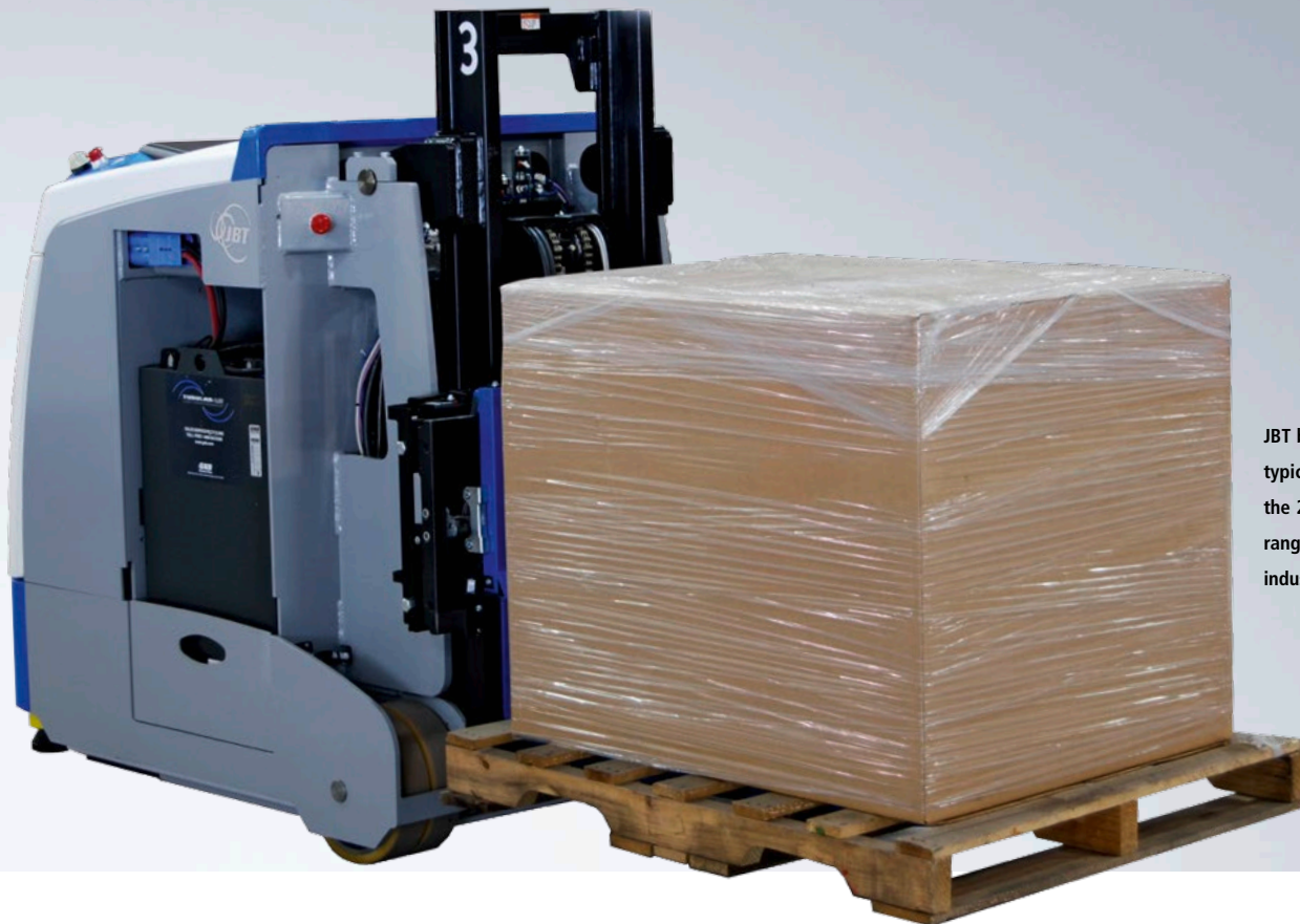
JBT builds custom AGVs, typically to move pallets in the 2,000- to 10,000-pound range, for customers across industries.

PC-based machine controllers from Beckhoff are deployed for AGV control in the field. The standard controller for JBT AGVs is the DIN rail-mounted CX5130 Embedded PC, which offers multi-core Intel Atom® E3827 processors and 4 GB DDR3 RAM. For vehicles with more compact enclosure sizes, CP6706 "economy" Panel PCs conveniently combine a 7-inch touchscreen and a 3.5-inch motherboard with Intel Atom® processors up to four cores for control and HMI. Most importantly, these solutions are scalable, adds Chhabria: "The Beckhoff CPUs are available in multiple performance levels and numbers of cores. If a complex application requires more processing power, we can replace the vehicle controller with another Beckhoff controller that will run the same TwinCAT software and Windows OS, so we know our application will be fully compatible."