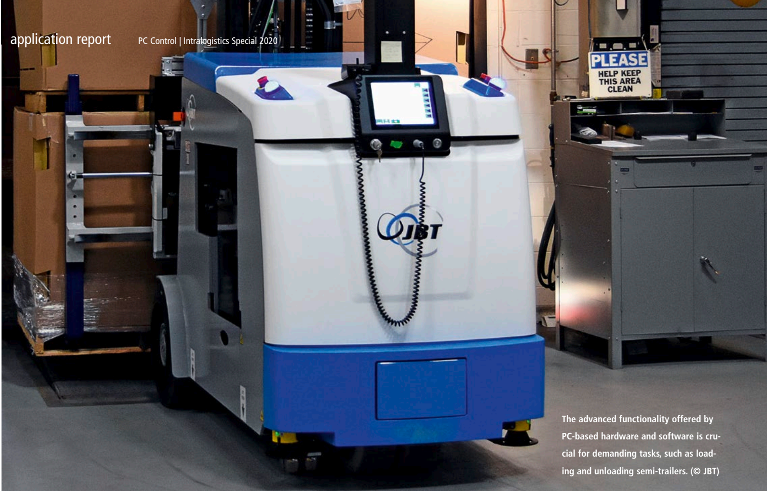
The advanced functionality offered by PC-based hardware and software is crucial for demanding tasks, such as loading and unloading semi-trailers.

all JBT divisions. With a global headquarters in Chicago, JBT is also a leading solutions provider to high-value segments of the food processing and air transportation industries.