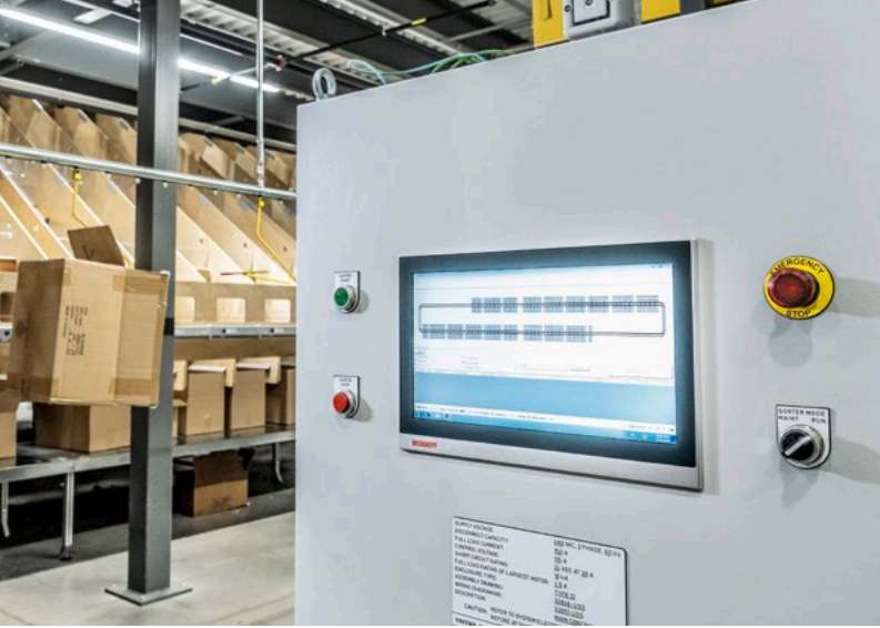
Operator interface with the EuroSort split tray sorters via Beckhoff CP2900 series multi-touch Control Panels.

panding the rack." Today, EuroSort relies on the compact CX2040 Embedded PC with 2.1 GHz Intel® Core™ i7 quad-core processors and 4 GB RAM to run PLC, safety and HMI on one device. EuroSort connects the embedded PCs to compact CP2907 Control Panels with 7-inch screen to display the HMI. For local data storage, the CX2040 also accommodates CFast memory cards up to 160 GB. Maintaining a compact footprint, this DIN rail-mounted automation controller measures just 144 mm x 99 mm x 91 mm and features a backplane connection to the EtherCAT Terminal system. This preserves the full performance and functionality of the protocol to every I/O point and all the way back to the main controller.