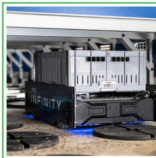
UNDER RACK MOVEMENT