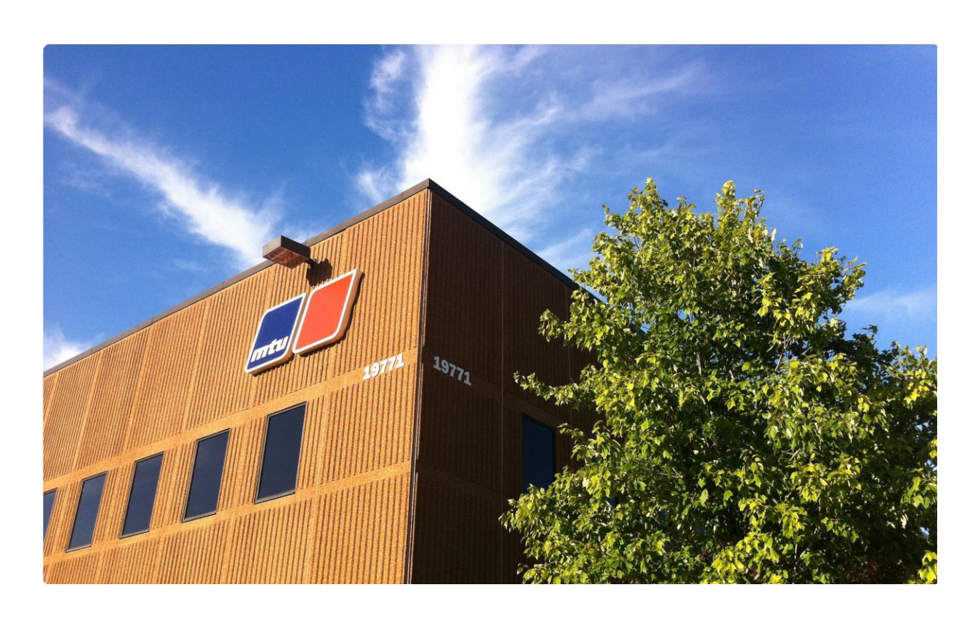
MTU America Lead Consultant