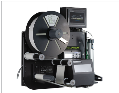
ACCOMMODATES A 14" ROLL, WITH A LOW LABEL SENSOR.