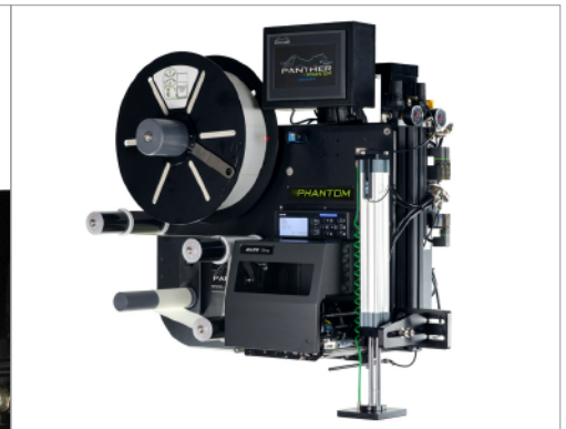
ZERO WASTE PNEUMATICS – ONLY USES AIR DURING OPERATION.