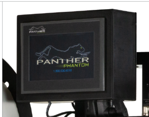
REMOTE-MOUNTED 7" TOUCH SCREEN DISPLAY ALLOWS FOR FLEXIBLE PLACEMENT OPTIONS.