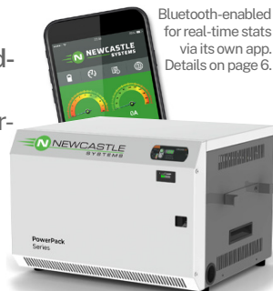
Bluetooth-enabled for real-time stats via its own app. Details on page 6.

State of the art stand-alone power. Lithium makes it much longer-lasting for great value, and lighter for easy transport.