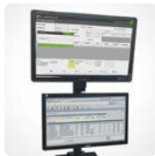
LCD and touch-screen mounts

Accessories shown here are just a sample of what we offer; visit newcastlesys.com or ask your salesperson for a complete list.