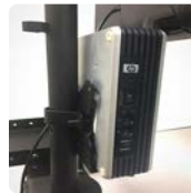
Thin client and CPU mounts