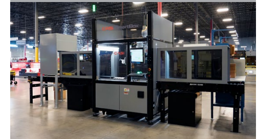
Automatic box-resizing system to reduce parcel shipping costs