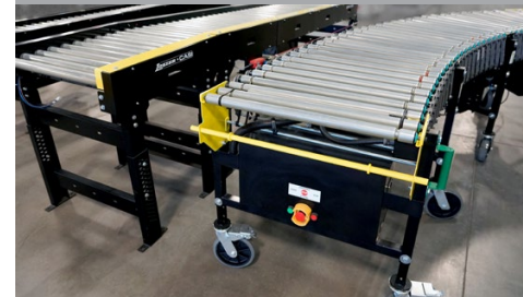
24-volt rigid & flexible conveyor