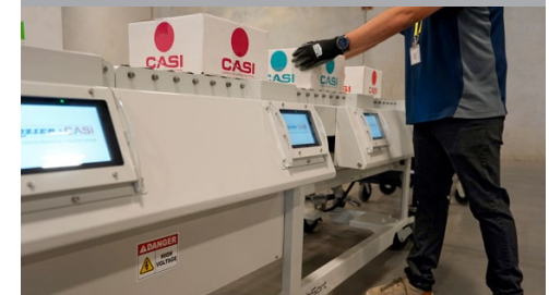
Automated unloading, receiving, and sorting