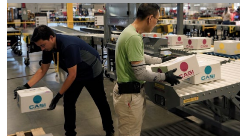
Sortation solutions for inbound and outbound