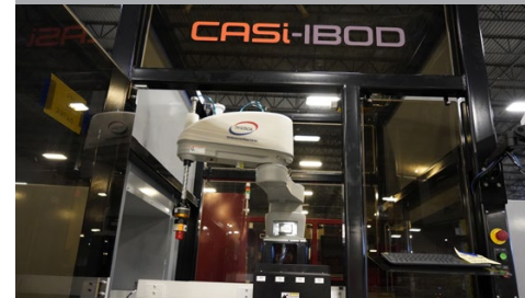
Intelligent Box Opening Device