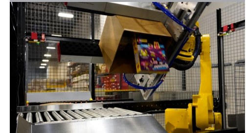
Automatically transfers box contents to a conveyor, bin, or workstation