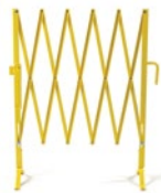
Portable Aisle Gate