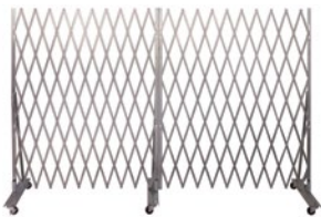
Portable Access Control Gate (Starter)