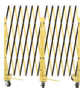
Portable Barrier Gate (Starter)