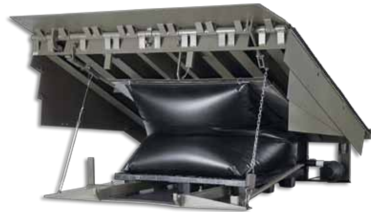
*Shown with structural C & I beam deck support and optional weather seal

NOVA's NAS Series Premium Air Powered Dock Leveler incorporates the use of a low-pressure, high-volume air system to raise and lower the platform. A single push-button activates the air powered system to raise the leveler and extend the lip. This simple, very reliable design requires only minimal maintenance.