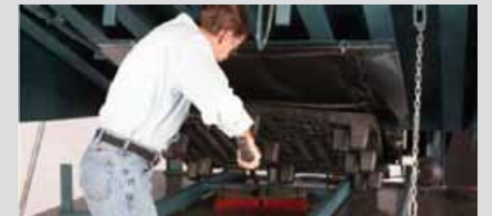
Easy clean leveler frame permits effortless clean out of pit floor.