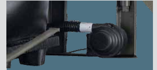
Low pressure 115V/1PH fan motor provides a high volume air supply to reliably activate and position leveler.