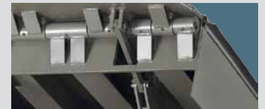
Dependable lip extension via unique lip latch mechanism is fully yieldable if impacted by backing trailer.