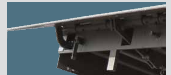
High strength piano hinge construction and lip extension mechanism.