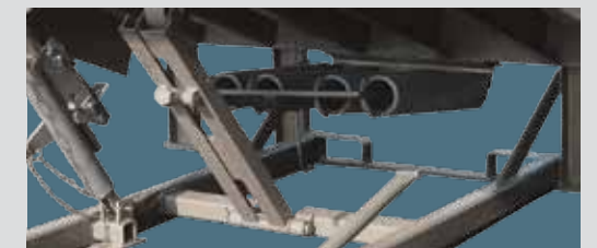
One point adjustable main spring assembly with roller and cam construction.