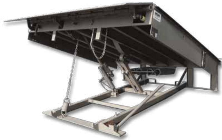
*Shown with structural C & I beam deck support and optional weather seal

NOVA's NMS Premium Mechanical Dock Leveler is designed to provide excellent reliability and structural durability at an affordable price. Easy pull-chain operation with a yieldable flip out lip and below dock end load controls make this full featured leveler a solid value.