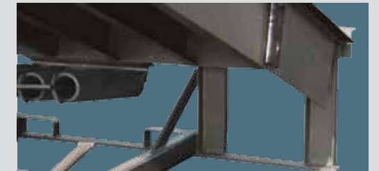
Full width rear hinge in compression with structural channel rear frame supports.