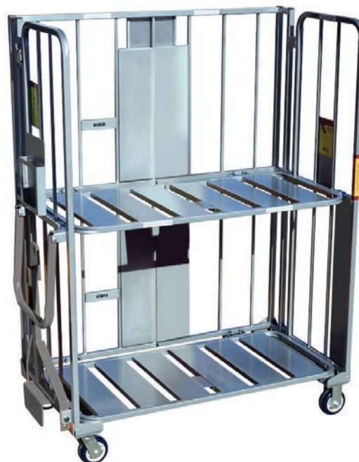
MODEL DC-2852TOW-2S-SLV Dimensions: 28½" W x 57¾" L x 70½" H

Constructed of all steel, powder coated silver. Shelves fold up and are held with slotted hinges. Shelves can be lifted or folded when not in use. Top shelf capacity 500lbs, Bottom shelf capacity 1000lbs. Tow hitch folds out when in use.