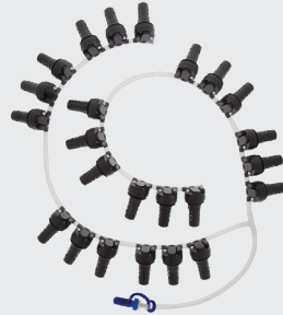
Fully Assembled Kit

Our watering system comes packaged in a kit specific to your battery's layout. We also provide a battery drawing to make the installation instructions easy to follow.