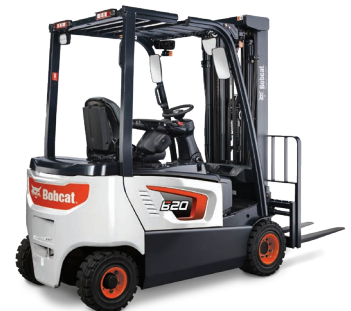
B16X-7 PLUS/ B18X-7/B20X-7

3,000 - 4,000 lb. Capacity Pneumatic Tire Electric, 48V