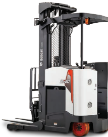
BR18SP-7 PLUS/BR20SP-7 PLUS

3,500 - 4,000 lb. Capacity Electric Pantograph Reach Truck, 36V