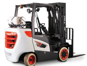
GC35S-9/GC35S-9 BCS/ GC45S-9/GC45S-9 BCS/ GC55C-9/GC55C-9 BCS

8,000 - 12,000 lb. Capacity Cushion Tire IC (LP)