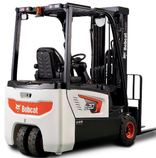
B15T-7 PLUS/ B18T-7 PLUS/B20T-7 PLUS

3,000 - 4,000 lb. Capacity 3-Wheel Pneumatic Tire Electric, 36/48V