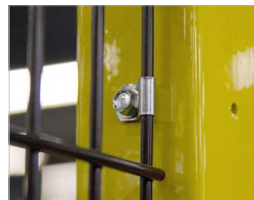
Easy to install with clip and Tek screws