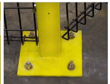
A 6" x 6" footplate is available for areas that need extra support