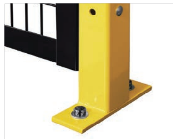
The sturdy 6" x 2" footplate makes the system extremely stable