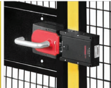
Safety Switch (Multiple Options Available)