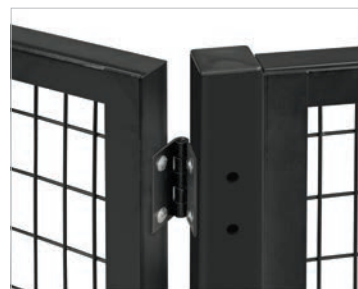
The angle panel kit can join two panels at any angle