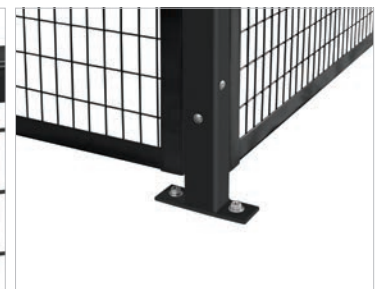
The sturdy 6" x 2" footplate makes the system extremely stable