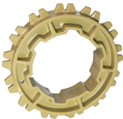
Intralox® patented MDR sprocket