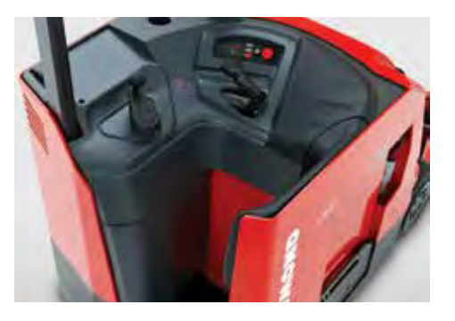
The ergonomically designed compartment and single, low-force deadman pedal reduce operator fatigue and enhance comfort.