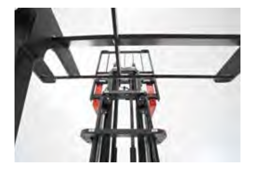
Operators will experience a clear view that allows them to see what they are moving, through the overhead guard right down to the floor.