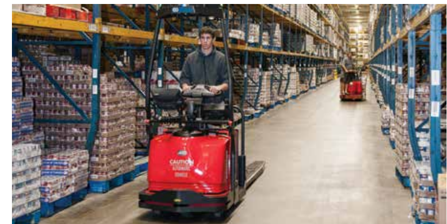
Program typical horizontal travel functions such as pauses, stops, horn honks and pallet drop-offs.

The Raymond Courier was designed to deliver the efficiency and productivity that Raymond products are known for. We call it Eco-Performance. You'll call it economizing without compromise. And Raymond's exclusive ACR System uses less energy than comparable AC systems. This allows for more uptime and keeps recharging time and energy costs to a minimum.