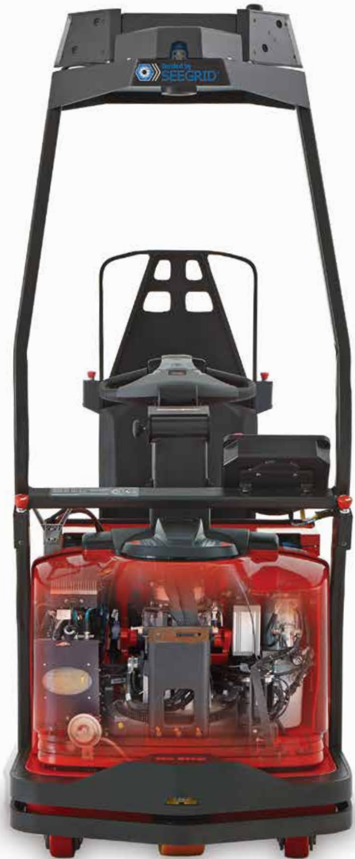
The Raymond Courier is built upon Raymond's durable and efficient pallet truck design - engineered with Best-in-Class components and then tested and calibrated for longer vehicle and component life.