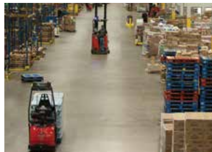
Raymond Automated Lift Trucks work in tandem with your existing fleet – and free up resources to work on other tasks.

The first members of the Raymond ALT fleet are the Raymond Couriercenter rider pallet truck and tow tractor. Built on Raymond's established 8000 Series pallet truck family, the Raymond Courier is the first truck that makes automation easy. Because they're built on Raymond's tried-and-true truck design, the Raymond Courier is fully supported and serviced by Raymond's nationwide network of authorized Sales and Service Centers – for one-stop service and support.