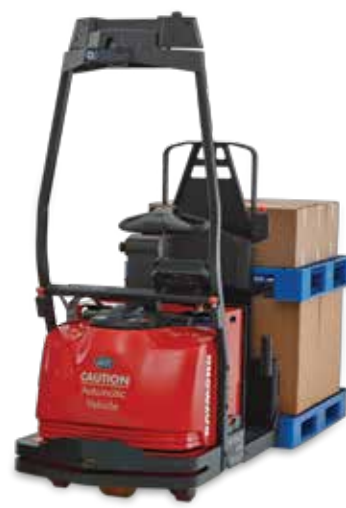
Raymond Courier Model 3010 Center Rider Pallet Truck