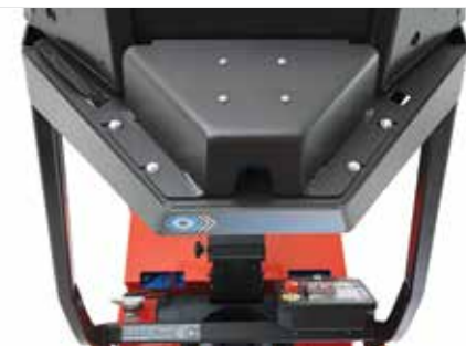
Advanced vision-guided technology captures image data from its surroundings, recording everything from turn locations, changes in speed, and when and where to drop a pallet.