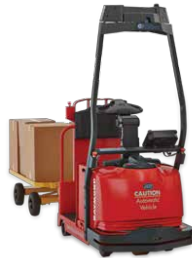
Raymond Courier Model 3020 Tow Tractor

The Raymond Courier paves the way for a new category of lift trucks. As warehouse managers bring more Raymond vehicles into their fleet, warehouses become more efficient. And you can count on Raymond to continue to be a leading innovator in the material handling industry. Contact your local Raymond authorized Sales and Service Center for an on-site consultation to see if the Raymond Courier is right for your operations.