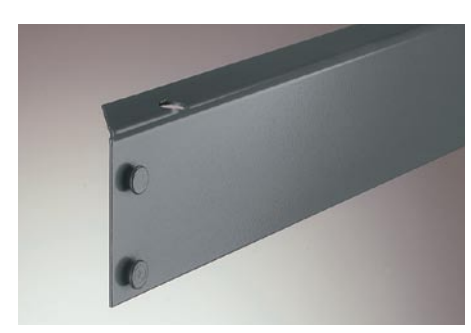
-14 gauge 1-1/8" x 2-3/4"