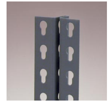
Rivet "T" Post 3" x 1-1/2" -14 gauge