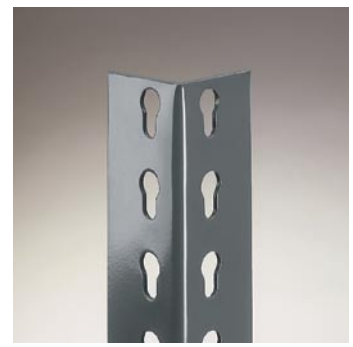
Heavy Rivet Angle Post 1-7/8" x 1-7/8" -13 gauge