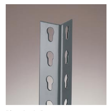
Rivet Angle Post 1-1/2" x 1-1/2" -13 gauge