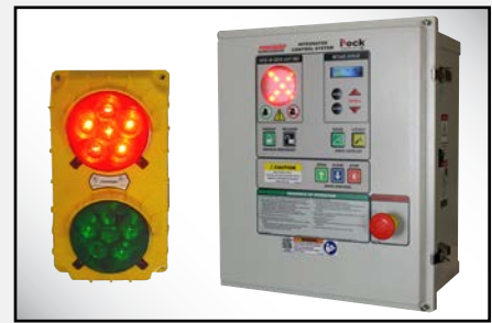
iDock® Controls includes light communication and can be integrated with other dock equipment.