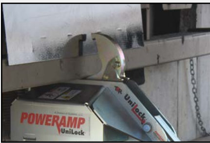
Locking mechanism maintains engagement even on intermodal trailers or an obstructed Rear Impact Guard (RIG).