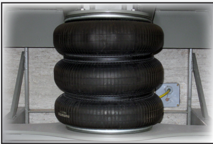
Steel belted rubber bellows system uses compressed air to raise platform.