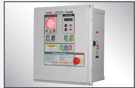
Optional iDock™ Controls offer enhanced operation and an interactive message display with equipment information.