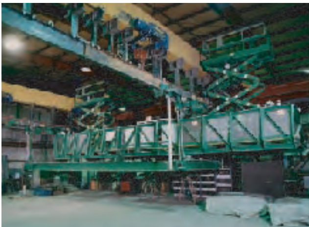
Factory Load and Operational Testing