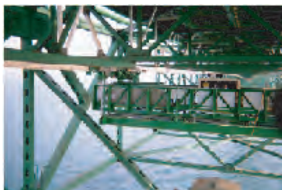
Traveler showing SAFTRACK™