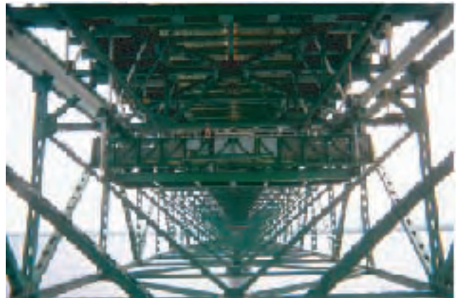
Suspended Span Traveler