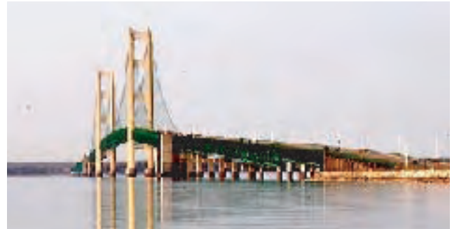
MACKINAC BRIDGE, MICHIGAN (8 Installed)