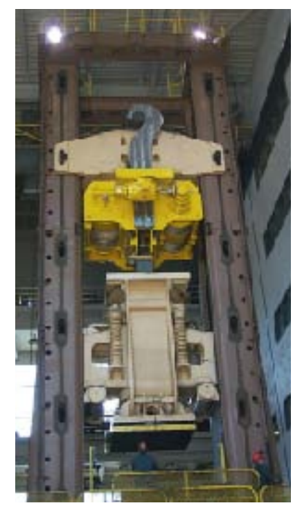
475 ton proof load test of special lifting device.