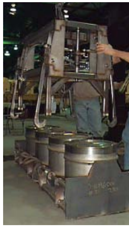
Stainless steel nuclear grapple.