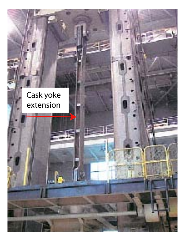
Cask lifting yoke extension shown during 390 ton proof test.