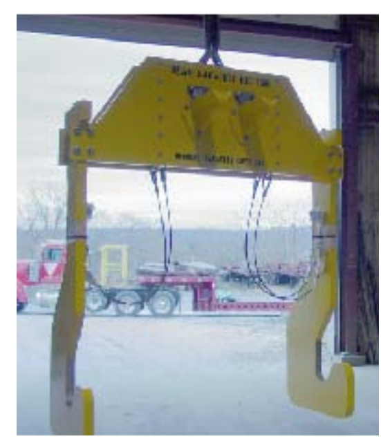
105 ton cask lift beam.