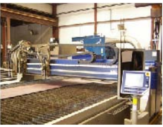
State-of-the-art plasma and oxy-fuel cutting machine featuring 10' x 42' cutting table.