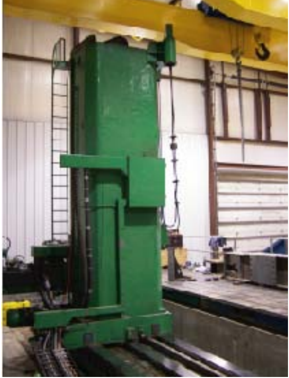
7" Gidding and Lewis floor type horizontal boring mill with 30' horizontal and 13' vertical travel supported with 30 ton overhead crane.