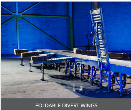
FOLDABLE DIVERT WINGS