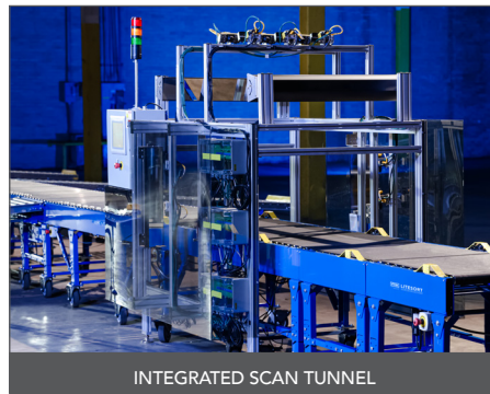
INTEGRATED SCAN TUNNEL