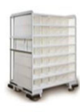
Portable Bin Cart Modules