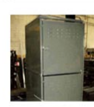
Custom Storage Lockers