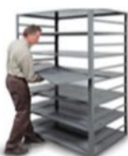
ASRS Archive Modules