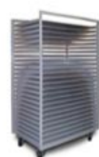
Flat Media Tray Carts