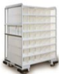
Portable Bin Cart Modules