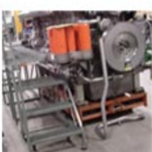
Assembly Floor Work Platforms