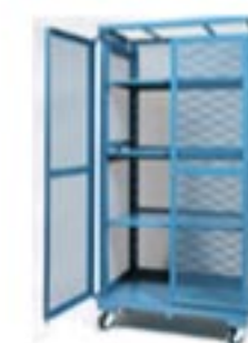
Person-Aboard Order Picking Modules