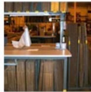
Shipping & Receiving Packaging Benches