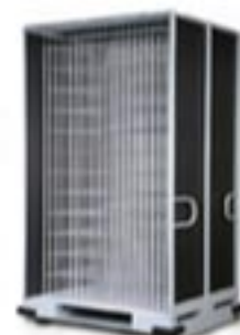
Portable Storage Modules