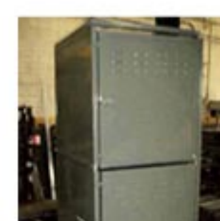
Custom Storage Lockers