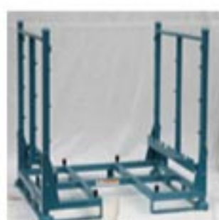
Returnable Equipment Racks