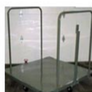
Purpose-Built Platform Trucks