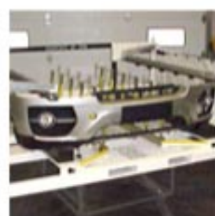
Returnable Bumper Racks