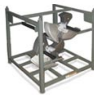
Returnable Equipment Racks (Non-Collapsing)