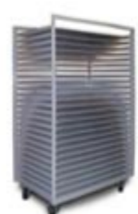
Flat Media Tray Carts