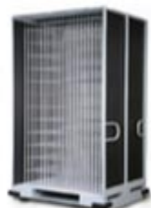
Portable Storage Modules