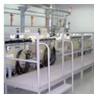
Custom Operations Platforms