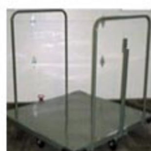
Purpose-Built Platform Trucks