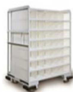
Portable Bin Cart Modules