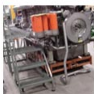
Assembly Floor Work Platforms