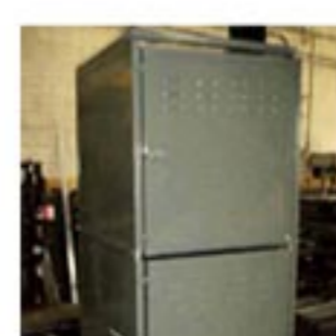
Custom Storage Lockers