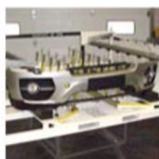
Returnable Bumper Racks