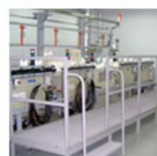
Custom Operations Platforms