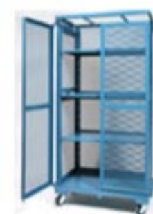
Person-Aboard Order Picking Modules