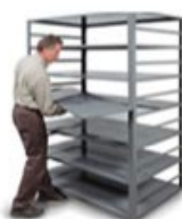
ASRS Archive Modules