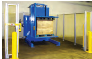
BOSCH GUARDING: Guarding which bolts directly to the floor with removable panels for maintenance access