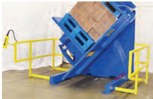
STANDARD MACHINE GUARDING: Provides protection from forklifts