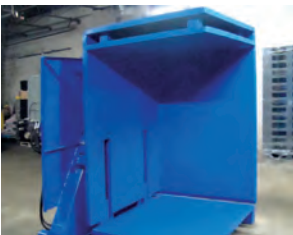
PROFILE PLATES: Used to reduce maximum and minimum jaw opening