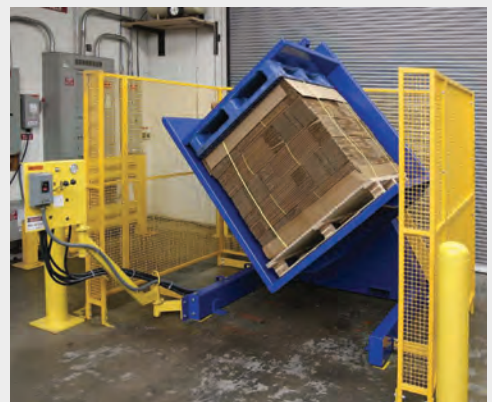
SAFELY TRANSFER CORRUGATE FROM A WOOD PALLET TO A PLASTIC PALLET