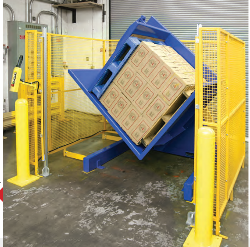
EASILY TRANSFER BOXES FROM A WOOD PALLET TO A PLASTIC PALLET