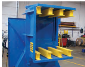
STAND OFFS: Allow for pallet-less loading and unloading