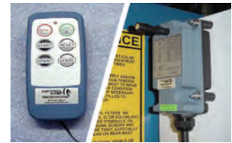
WIRELESS REMOTE: Receiver mounts to machine