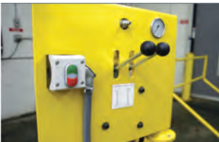
LEVERS: Basic control package will turn machine on/off, as well as clamp, un-clamp, and rotate