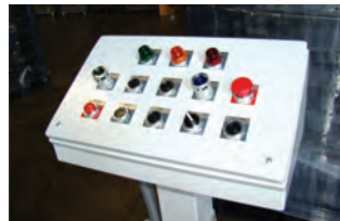
CONSOLE: Offers added operational features to provide maximum control of machine