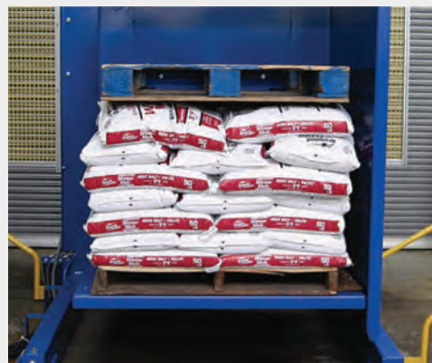
QUICKLY RECOVER DAMAGED GOODS OR BROKEN BOARDS FROM THE BOTTOM OF THE STACK