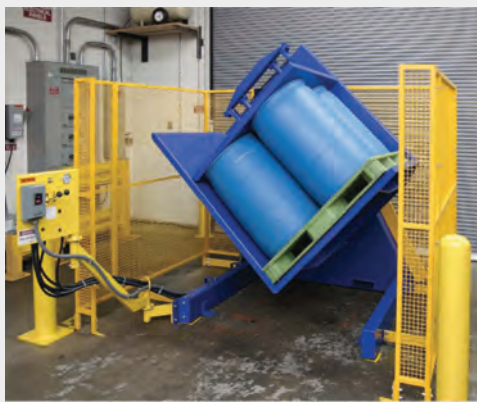
EASILY TRANSFER DRUMS FROM ONE PALLET TO ANOTHER