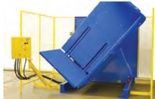
HIGH STYLE GUARDING: Provides additional protection for forklift operators (mounted directly to the machine)