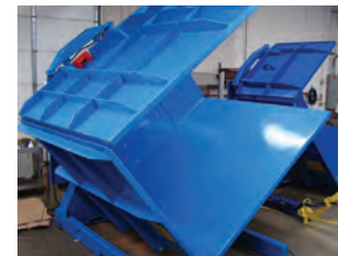
CUSTOM-SIZED TABLE: Larger and smaller platforms available for custom-sized loads