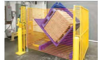
LIGHT CURTAINS: Provides a soft guarding across the front of the machine for additional protection