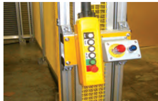
PUSH BUTTON: Comes on a 30-foot cord with E-stop, lock out tag/out and pendant holder