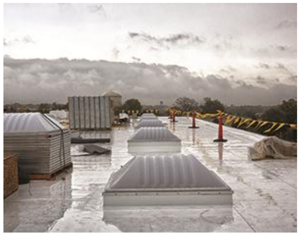
Prismatic lenses for skylights disperse natural sunlight into a facility more effectively. Combined with photocell sensors on high efficiency lights, such "daylighting" technology can cut lighting costs dramatically.

Warehouse and distribution center construction is making a comeback and so is the desire to get back to green. Our facility design experts offer their take on the evolving benefits and share why sustainable design holds more value than ever.