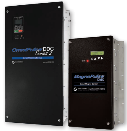
OmniPulse™ DDC Series 2 and MagnePulse DMC

You can be assured that Magnetek will continue to be the leader in crane control technology, and the first to bring you innovations to improve the performance of your overhead material handling system.