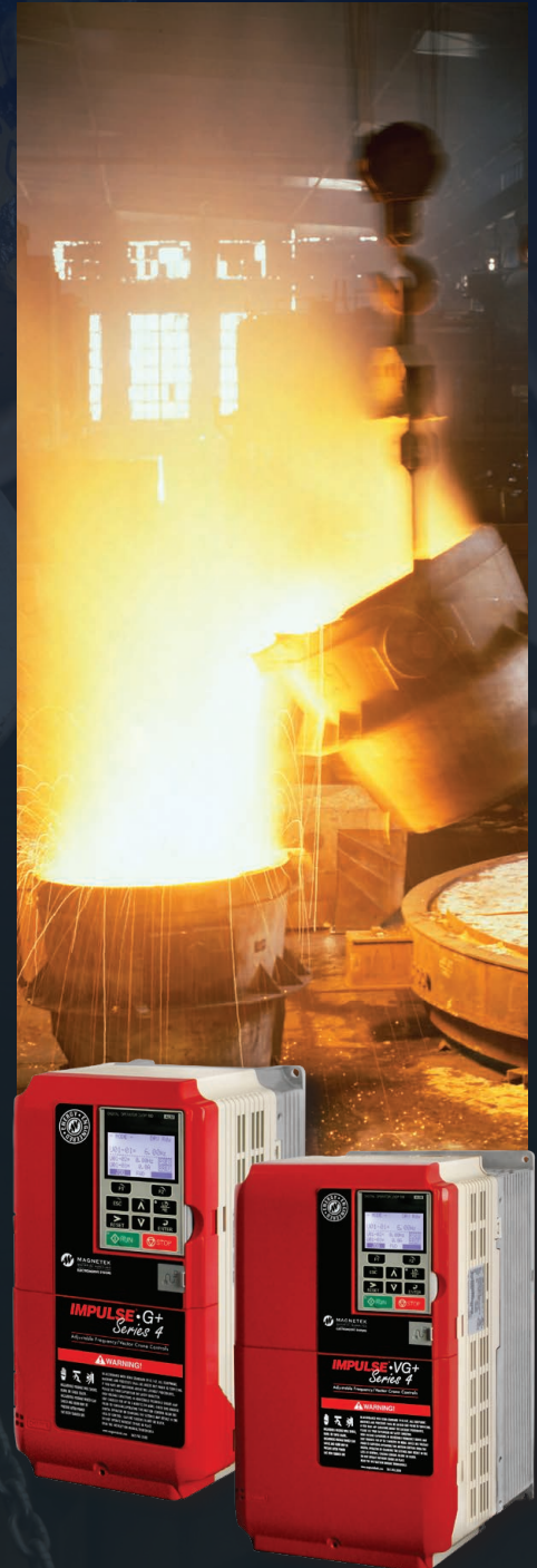
Industry-Leading Variable Frequency Drives

AC Static Stepless controls were once the "premier" crane control, providing infinite speed regulation and precision load handling for the most demanding applications. However, prolonged use at low speeds often resulted in abnormal motor heating. VFDs with Flux Vector controls have proven to provide superior performance, at a lower cost and without motor heating problems.