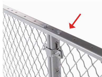
TOP CAPPING CHANNELS