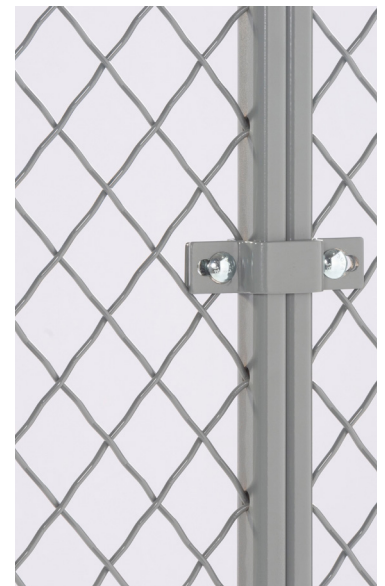
10-GAUGE TRIPLE CRIMPED STEEL WITH COLNEL CLAMP