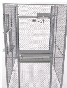
HINGE DOOR W/CLOSER