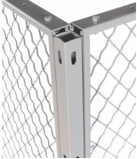
FWP at Corner

Line posts are constructed of 3½" x 1¼" channel with 4"x 7½" base plates for reinforcing fencing. It's recommended to use line posts every 15 linear feet on 7' and 8' high systems. But, on 9', 10', and 12' high systems, lines posts are needed every 10 linear feet.