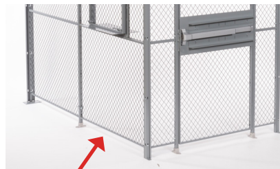
3.7” SWEEP SPACE

Panel frames are interlocked at the corners with mortised and tenon joints then punched with slotted holes for easy installation. Each panel has a 3.7” sweep space allowing for cage housekeeping. A cold, rolled sheet metal sweep guard may be added for high security applications. Another unique feature of FordLogan panels are the 1½” x ½” roll-formed top capping channels that bolt through horizontal frames to enclose wires and provide extra rigidity.