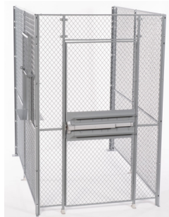
HINGED PANIC-BAR DOOR