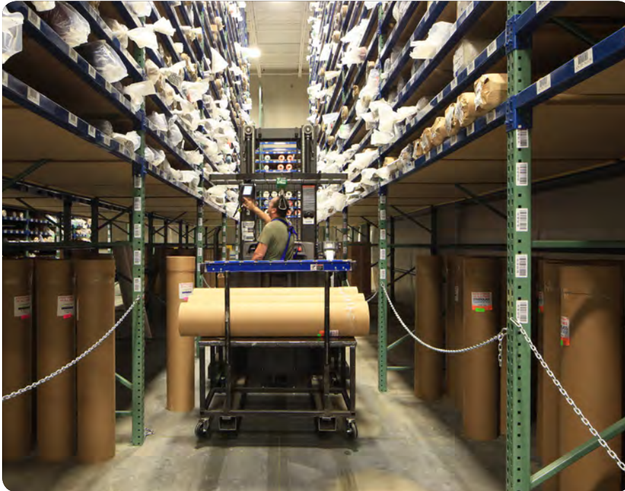
Just as there are three times the shelves of a normal bay packed into Trivantage's system, there are also five-times more pallet positions.

technical it is, the more involved it is, the more design there is, the more we like it."