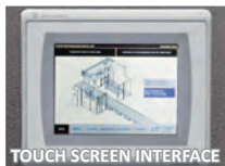
TOUCH SCREEN INTERFACE