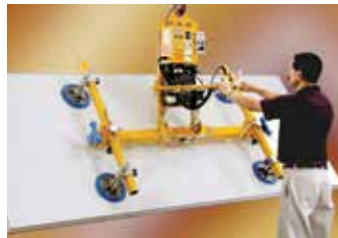
Anver Vacuum Lifter