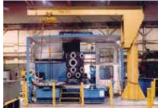
Gorbel Free Standing Jib Crane