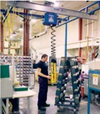
Gorbel G Force