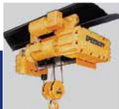
ACCO Monorail Hoist