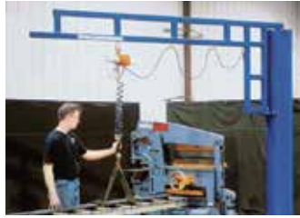
Gorbel Work Station Jib Crane