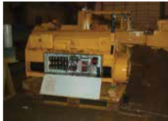
Hoist Control Modernization