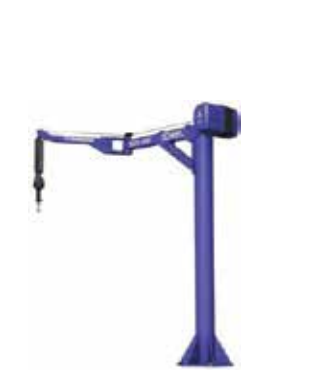
Gorbel Easy Arm