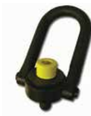
American Lifting Ring