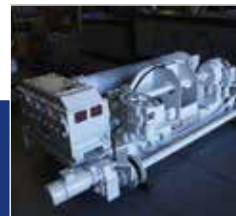
Top Running Trolley Hoist