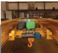
Nestled Trolley Hoist