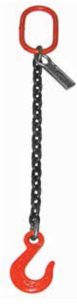
Alloy Chain Slings