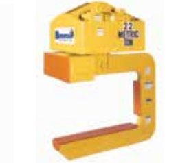
Bushman Motorized C Hook