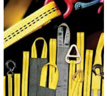
Wear-Flex Nylon Slings