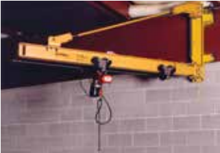
Gorbel Wall Bracket Jib Crane