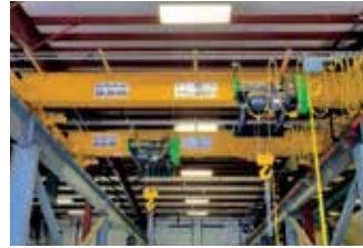
Top Running Single Girder