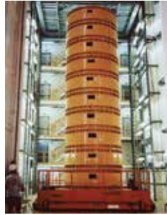
AeroGo Air Pallet