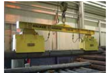
Walker Magnet Bundle Handling