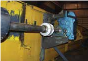
In Fabrication Center Drive