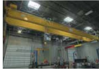
Top Running Double Girder Crane