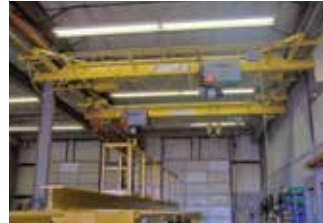
Under Running Single Girder