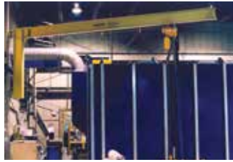
Gorbel Wall Cantilever Jib Crane