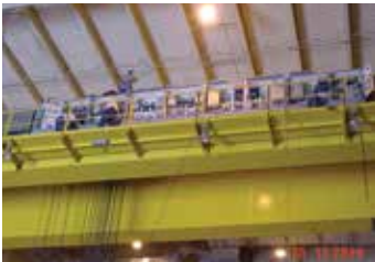
Crane Control Modernization