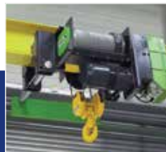
Stahl Monorail Hoist