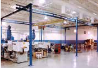
Gorbel Free Standing Work Station Crane